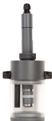
HaloSense sensor in a single closed flow cell