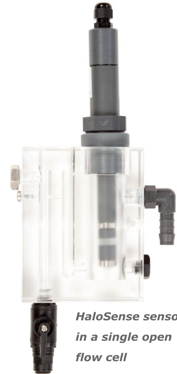
HaloSense sensor in a single open flow cell

The HaloSense sensor is a three electrode chrono amperometric potentiostatic sensor. The free chlorine molecules diffuse through the membrane and come into contact with the electrolyte. The electrolyte has a low pH which converts the majority of the OCl - to HOCl. All the HOCl is reduced at the gold cathode and the resultant ions travel through the electrolyte where they are oxidized at the silver/silver chloride anode. The current flow is proportional to the concentration of free chlorine in the sample. The anode and cathode are held at the potential difference that provides an optimum catalytic reduction of HOCl.