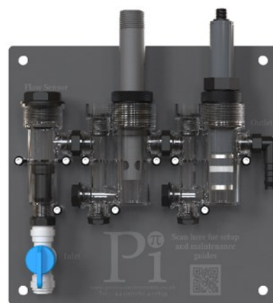
ORP2 sensor in a double open or closed flow cell with a chlorine sensor