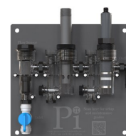
Double flow cell (open or closed)