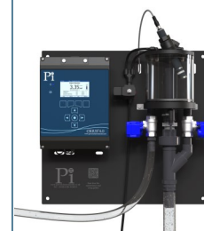
Single or double sensor Autoflush